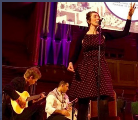
Chai for All performed Jewish and Arabic songs